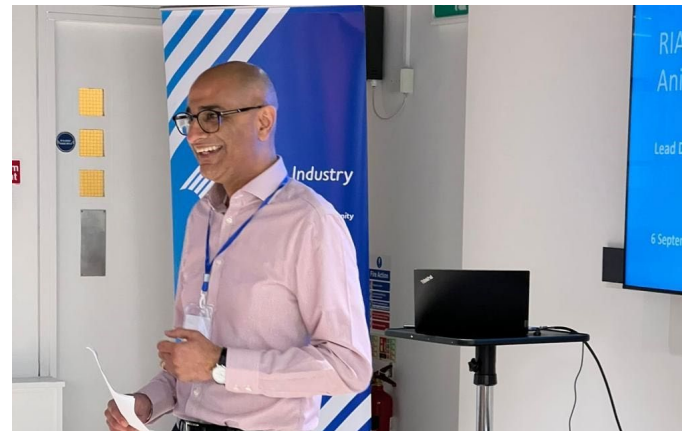
Making the case for GBR