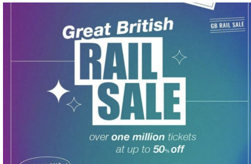
Driving revenue growth